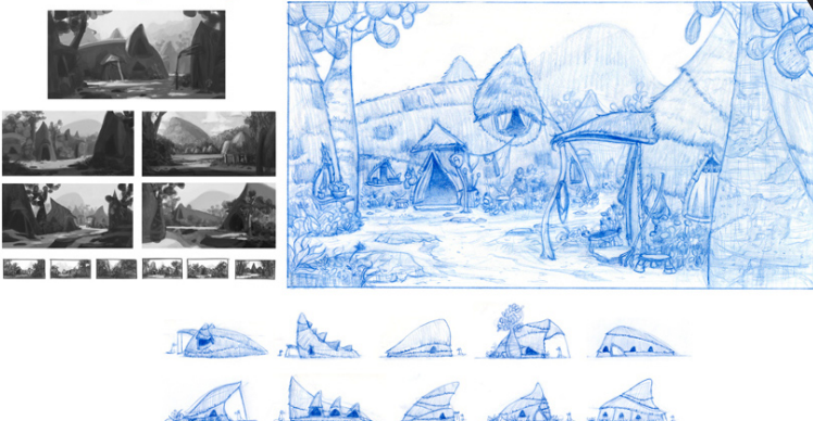
Ganua Village Design